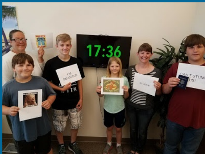
Escape from Port-au-Prince success!

What is an "escape room?" It's a very popular type of entertainment for groups of 4-8 people who are all "locked" in a room with 60 minutes. The goal is to solve a series of puzzles and locks using only clues and hints within the room and try to "escape" before time runs out. There are other variations from room to room, but that's the basic premise.