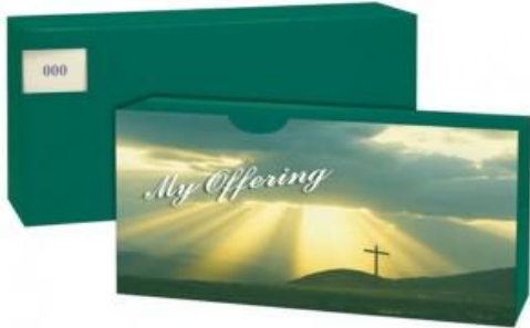
2016 Offering Envelopes

Offering Envelopes are available this Sunday in the Church Lobby. If you have not signed up for envelopes but would like them, please sign up in the church office.