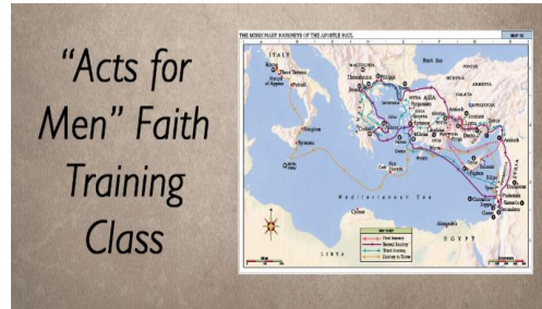
New Faith Training class for Men!

Offering Envelopes are available this Sunday in the Church Lobby. If you have not signed up for envelopes but would like them, please sign up in the church office.