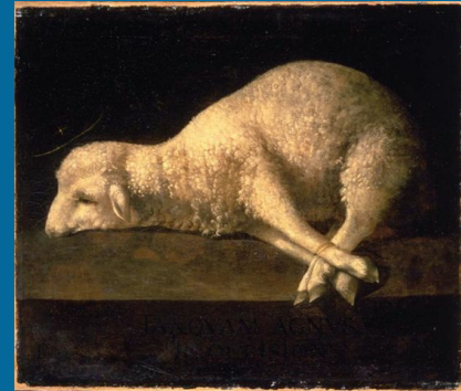
Old Testament Offering

counted no fewer than 6 DIFFERENT offerings ordained by God to be performed by the priests.