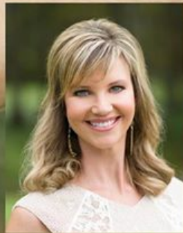
Duck Dynasty's Missy Robertson