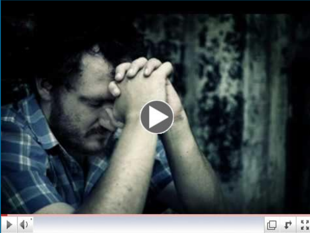
Casting Crowns - "Praise You in this Storm"

It makes me think of the song by Casting Crowns, Praise You in this Storm.