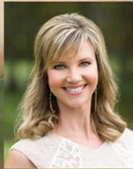
Duck Dynasty's Missy Robertson